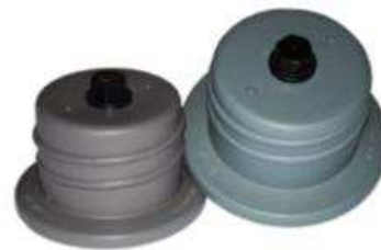
TTR-E 100 cap