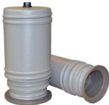
TTR-E 450 cap

In an aggressive environment, the anchor head must be immediately protected, both with temporary and with permanent anchors. The protection inside the head provides an efficient connection with the free length protection, in order to protect the small reinforcement section below and through the bearing plate. The grouting of the back part of the anchorage can be carried out from the central hole, which also allows air to be released. The back filling of the anchorage, together with the containment offered by the under plate protection, represent the correct application to guarantee the necessary protection. If no reloading and stressing controls are required, resins, mixtures and other sealing products can be inserted into the head cap. On the contrary, if reloading and stressing controls are required, the protection of the external part of the head, including the cap and its content, must be removable. It must be possible to reload the cap with the anticorrosion product.